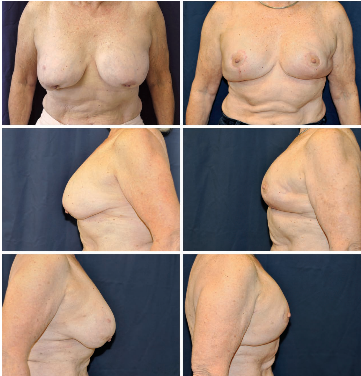
Fig. 4. A 76-year-old woman presented with left breast intraductal carcinoma. Her preoperative body mass index was 23 kg/m 2 . She had pre-existing subpectoral silicone gel implants following breast augmentation. She underwent bilateral mastectomy, bilateral explantation, and immediate direct-to-implant reconstruction with nipple-sparing mastopexy. Her mastectomy specimens weighed 488 g on the right and 370 g on the left. Smooth round 250-cc implants were used. The implants were placed in the subpectoral position. No acellular dermal matrix was used. (Left) Preoperative views. (Right) Twenty-four-month postoperative views.

was reliable in assessing viability intraoperatively. While it was not required in the 65 women in this series, the ability to remove the nipple-areolar complex and replace it as a free nipple graft presents a viable alternative in the event its viability is compromised during flap elevation. Free nipple grafting is a possibility in all patients given the possibility of delayed vascular compromise; however,