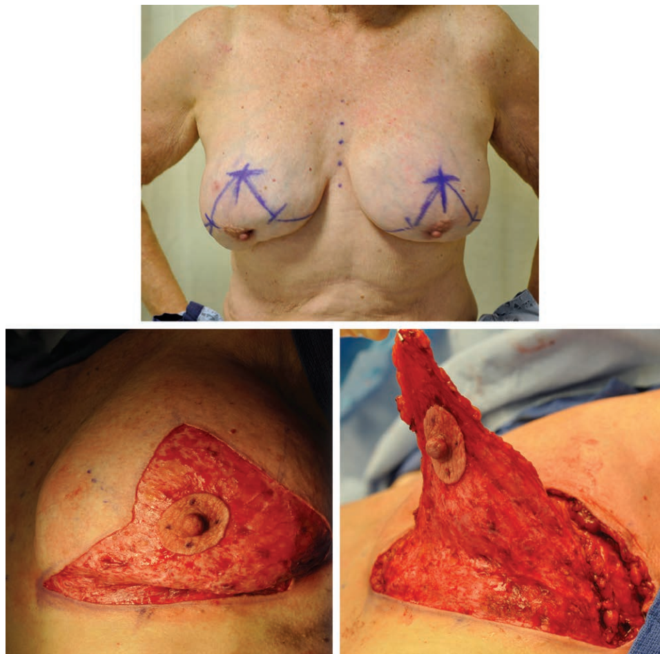
Fig. 1. (Above) Preoperative view showing incisional markings. (Below, left) Intraoperative view of de-epithelialized inferior flap. (Below, right) Intraoperative view of viable nipple-areolar complex on the elevated inferiorly based adipodermal flap.

tissue from the base of the nipple-areolar complex as a separate biopsy, leaving a thin residual layer of retroareolar tissue to preserve vascularity. 15,16 This is, in fact, our technique. We leave several millimeters of subdermal retroareolar nipple-areolar complex tissue and routinely send a subareolar margin biopsy sample for permanent sectioning. This both minimizes nipple-areolar complex necrosis rates and confirms a negative margin.