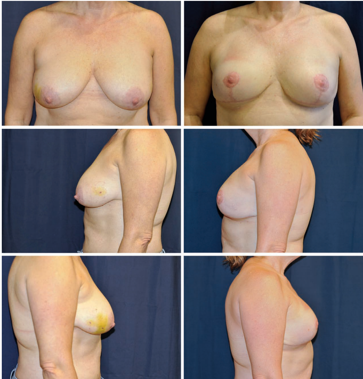
Fig. 2. A 51-year-old woman presented with right breast intraductal carcinoma and a preoperative body mass index of 33 kg/m 2 . She underwent bilateral mastectomy with immediate direct-to-implant reconstruction with nipple-sparing mastopexy. Her mastectomy specimens weighed 821 g on the right and 736 g on the left. Anatomical 775-cc implants were used. The implants were placed in the subpectoral position with acellular dermal matrix extension. ( Left ) Preoperative views. ( Right ) Seven-month postoperative views.

along the entire inframammary fold. Patients were included regardless of age, breast size, or degree of ptosis. This now provides an option for women who otherwise may not be considered for nipple-sparing mastectomy or direct-to-implant reconstruction.